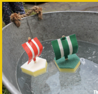
How to make an easy sponge boat craft You will need: